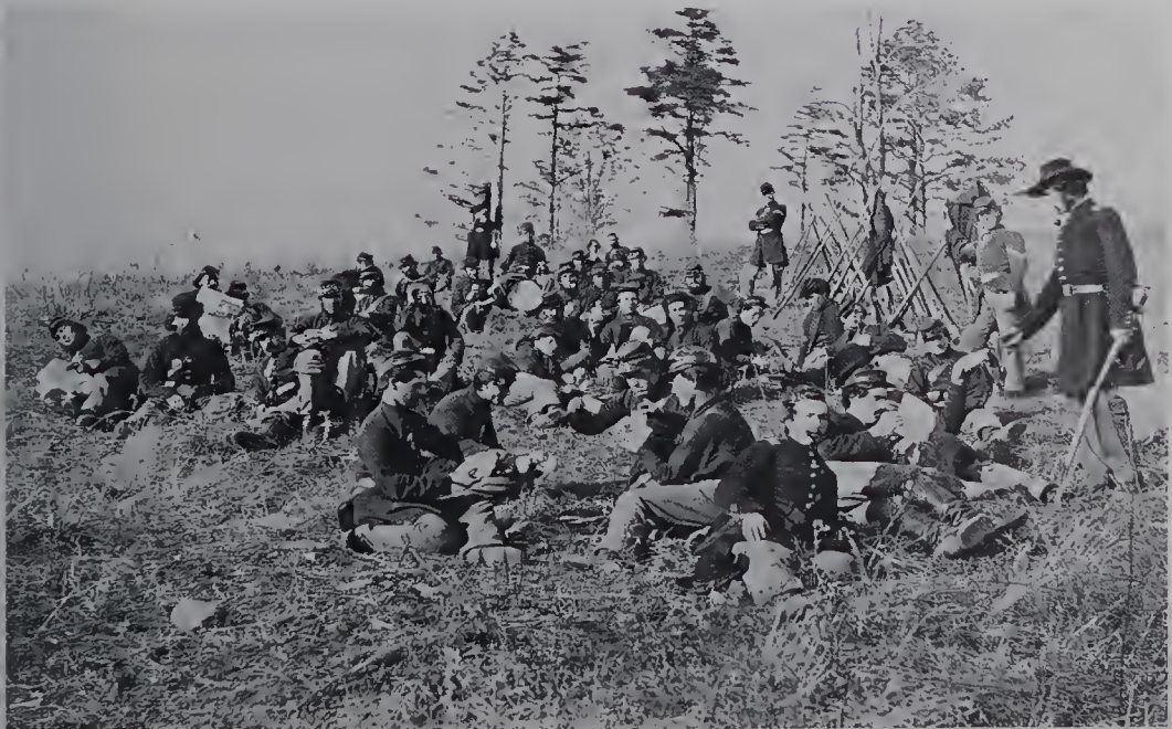
Company B, 170th New York Infantry, in front of Petersburg, Virginia.